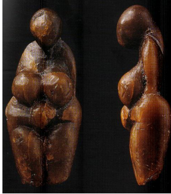
Fig. 2 Brown steatite goddess, 48 mm. 22 000/17 000 BCE (Cohen 2003: 45).

It is not a difficult thing to imagine that this art was created in honour of a female principle (as well as the manifested reality of Woman), whose creative ability and rich connections to Earth and Moon carried communities into their future. It is not only these attributes of the Great Mother, however, which were honoured in ancient times, nor which we Journey with in the present day. There are the darker aspects of the Mother, necessary for wholeness and the harvest, be that agricultural, personal or spiritual. This is the lesson of the Great Mother; the Journey to sovereignty over Self.